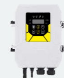
DC Solar Controller