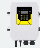
DC Solar Controller