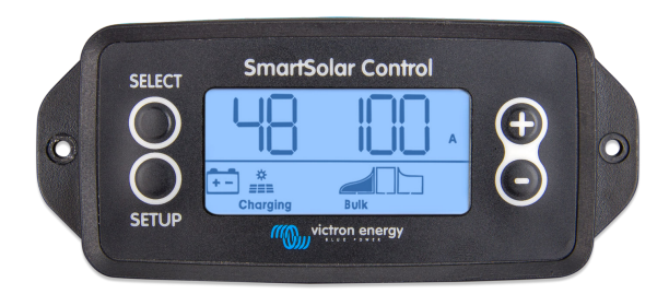
SmartSolar Control front view