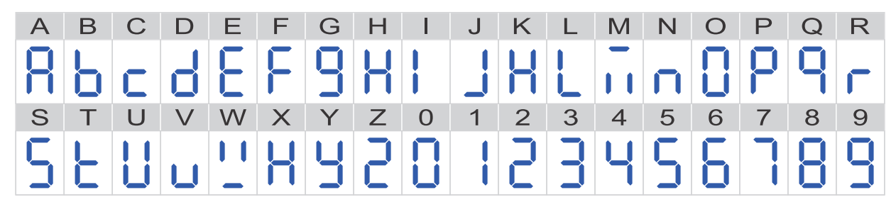
The digits used to represent letters and numbers

The buttons on the front of the display are used to navigate through the solar charger readings and are used when making solar controller and display settings. They have the following functions: