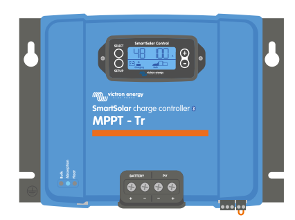
Example of a solar charger without display and with display

The display plugs directly into the front face of the solar charger. It can act as both a permanent or a temporary display. Simply remove the plastic cover that protects the display terminal on the front of the controller and then plug in the display.