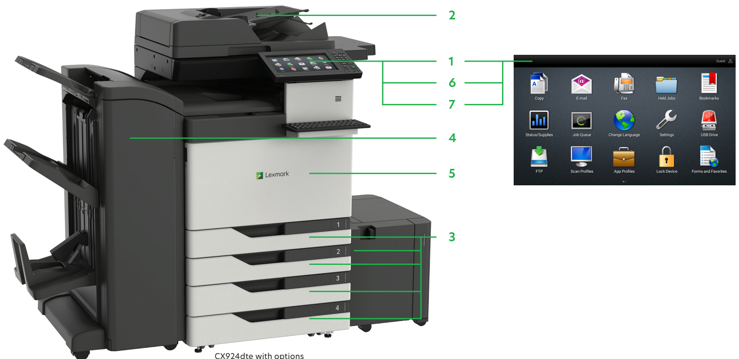
CX924dte with options

Print Microsoft Office files, PDFs and other document and image types from flash drives, or select and print documents from network servers or online drives.