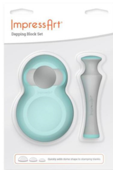
Dapping Block Set TL00351