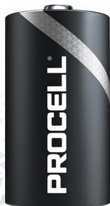
Size: D (LR20) PC1300