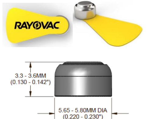
DIMENSIONS SHOWN ARE IEC STANDARDS. FOR ENGINEERING TOLERANCES CONTACT RAYOVAC.