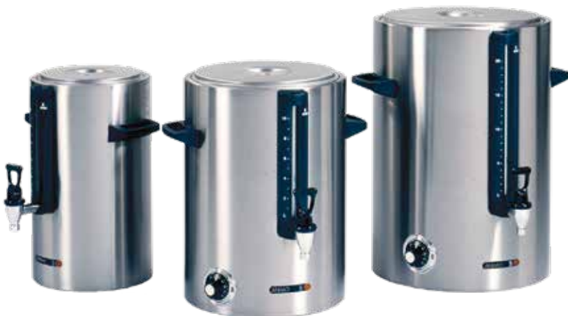
+ WKT-D - series