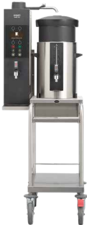
+ Type - J