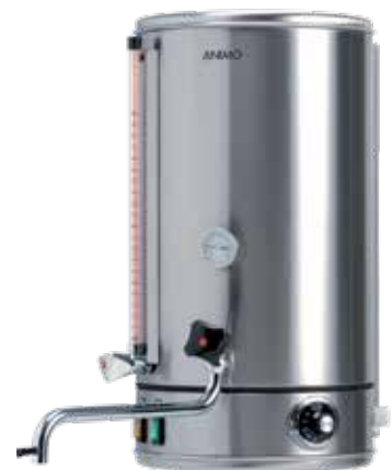
+ WKI - series