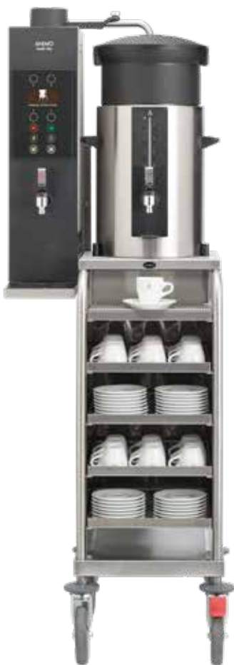
+ Type - JR (Type ST is suitable for large containers)