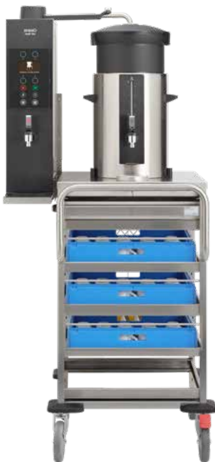
+ Type - SK 10 VL