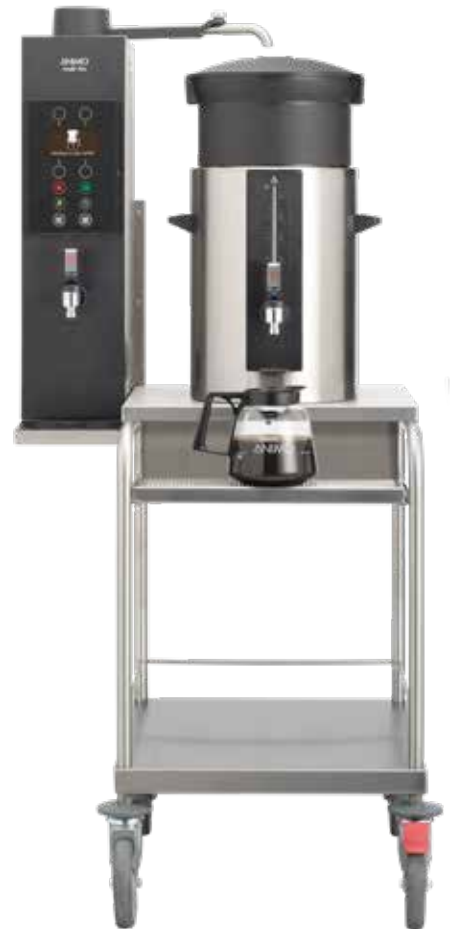
+ Type - S (Type - C is suitable for 2 containers)