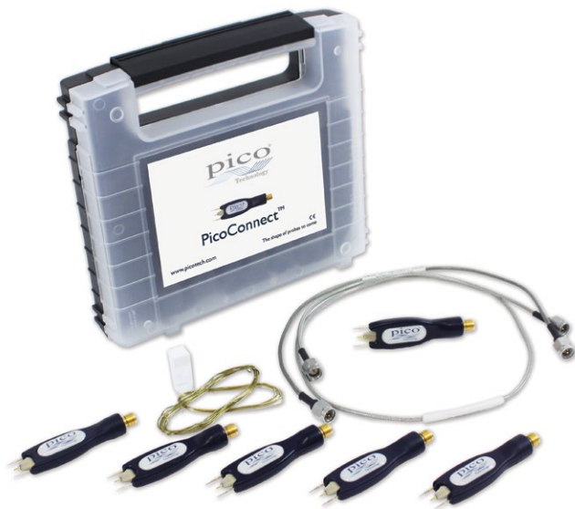
PicoConnect™ 900 Series kit

Batter Fly s.r.l. - Tel. (+39) 051 6468377 - info@batterfly.com - www.batterfly.com - Italy