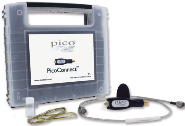
PicoConnect™ 900 Series probe