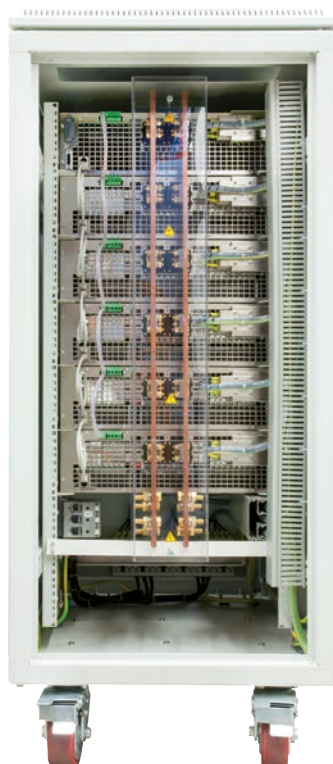
Rear view 24U 90 kW