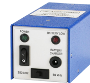
CGC-255E Conducted Comb Generator