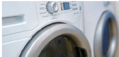
Quality Assurance Test