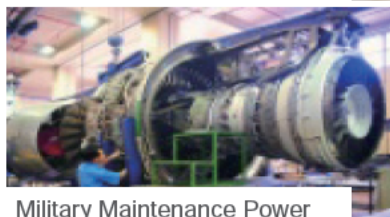
Military Maintenance Power