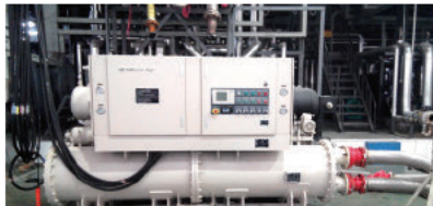
Burn-In, Aging Test