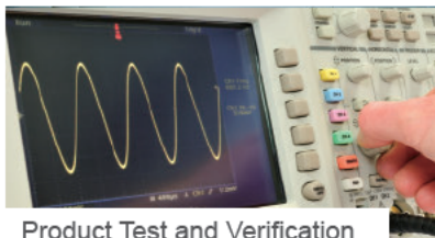
Product Test and Verification