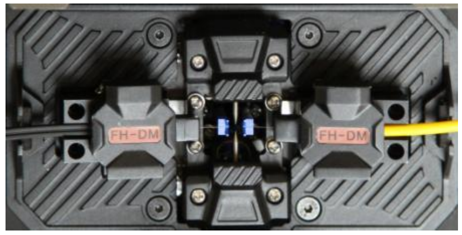
All-in-one optical fiber fixture