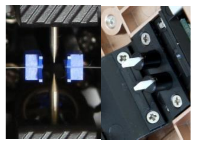
High-precision ceramic V-groove and presser foot