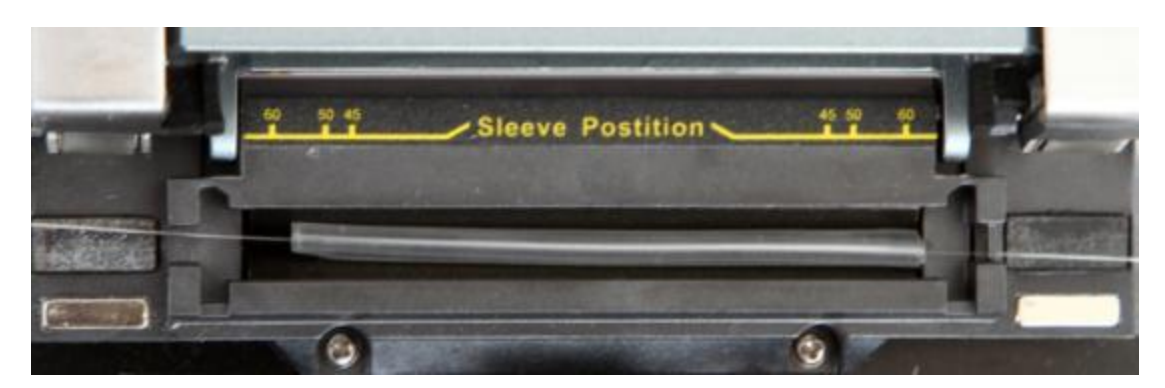
Hear and detection unit