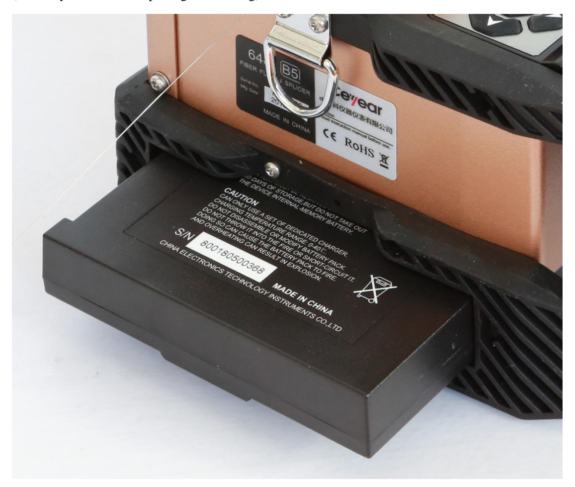
Built-in pluggable lithium battery with large-capacity

(normally 220 times of splicing and heating).