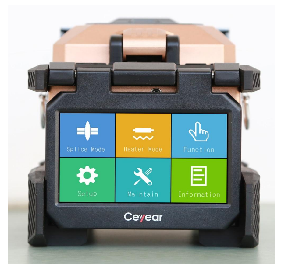
Entirely new GUI and touch screen

Operators can set up the splicer and get relevant information easily as 6481 has been designed by new GUI and touch screen.