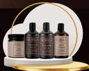
CONDITIONERS, MASKS AND MILKS