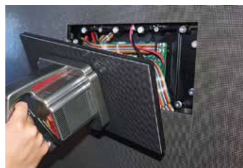
QUALITY IN DETAIL