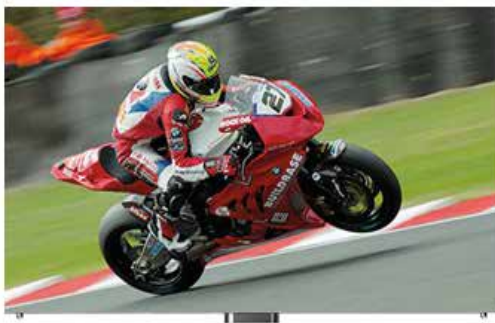
Perfect Rendering Dynamic Picture