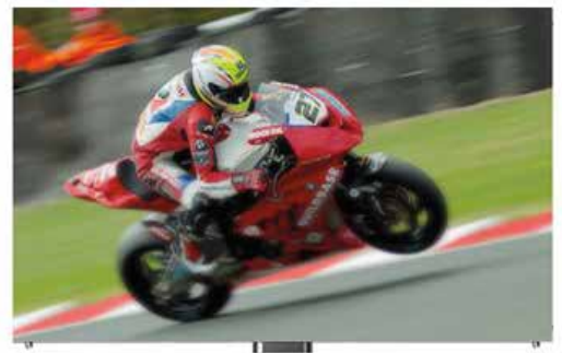
Smear Ghosting Phenomenon