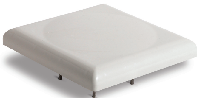
7 DBI CIRCULAR ANTENNA