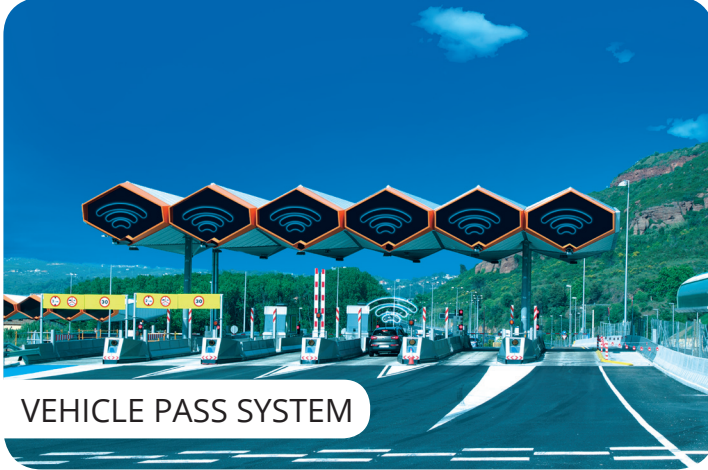
VEHICLE PASS SYSTEM