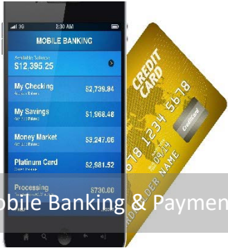
Mobile Banking & Payment