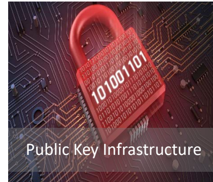
Public Key Infrastructure