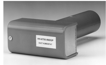
HH-6705-9N0GP Duct Humidistat